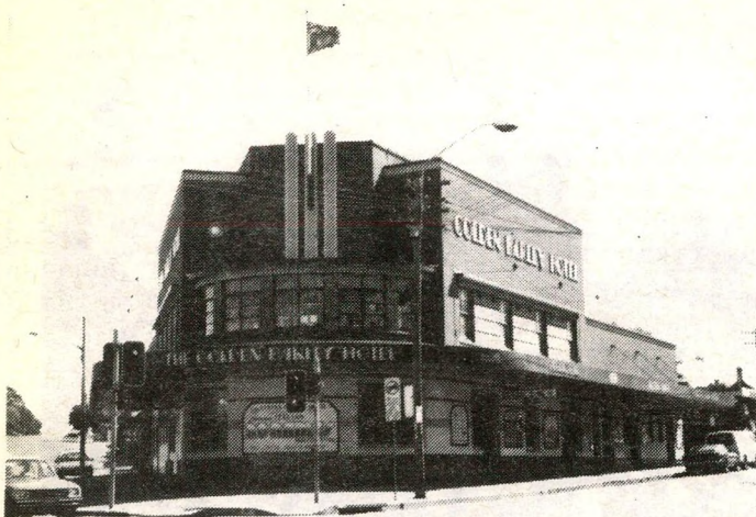
The Golden Barley Hotel, the best preserved Art Deco pub in the Municipality.