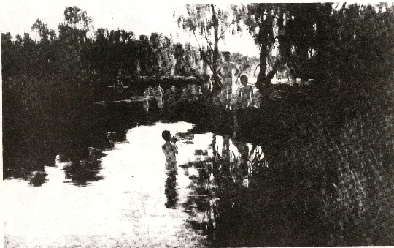
Sydney Long was only 16 when he painted 'By Tranquil Waters', in 1894. It reputedly depicts Cooks River. Oil on canvas. Collection, Art Gallery of NSW.