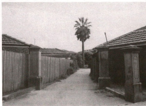
Woodcourt gateposts & two early palms (1985)