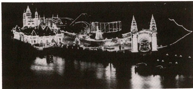
Luna Park (1935)