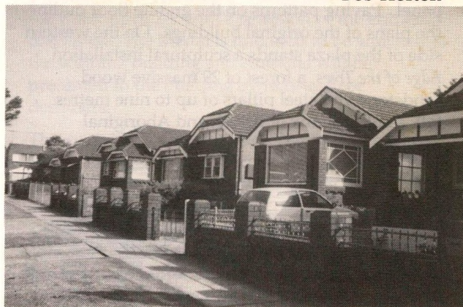
Houses on Stanley Street, Tempe linked together by colour, style, set-back, original brick fencing and half-hipped gables.