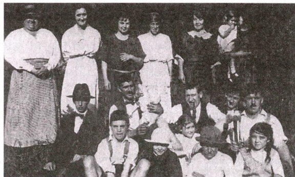
North Newtown crowd at an office picnic at Cronulla, about 1919 (from Before the Phone )