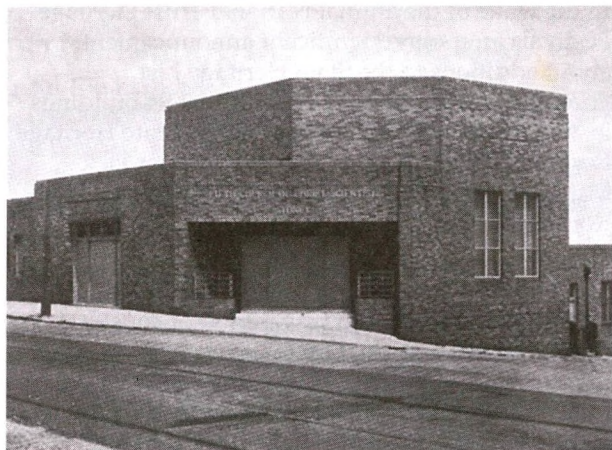
Metropolitan Community Church Petersham (The Story of Petersham 1948)