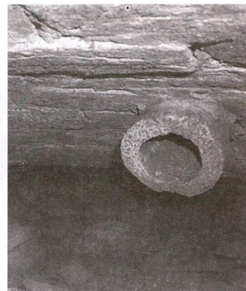
Scott MacArthur and well

The neighbouring house dates from the early 1900s and its boundary wall straddles the well's dome with a brick arch. They are going to remove more paving from around the top of the well and debris from inside in the hope of finding clues to how the well was used and when it was constructed. As an aside, Percy Voyce was an eccentric collector of pianolas and antique musical instruments, and had a huge collection of pianola rolls that were largely destroyed during a house fire.