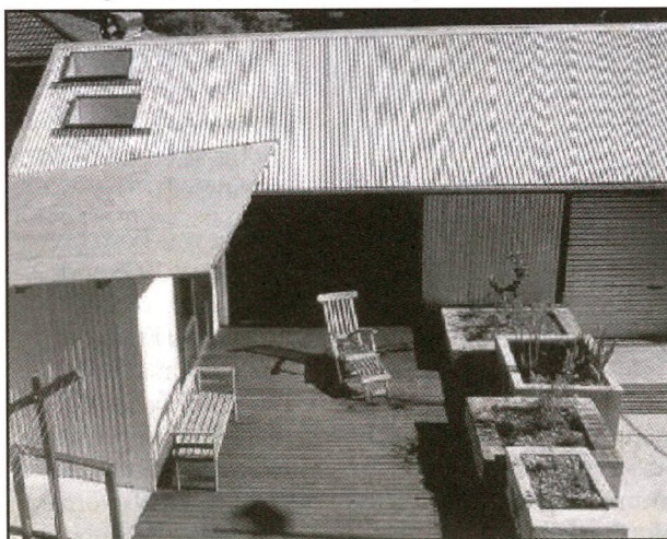
Medal winner