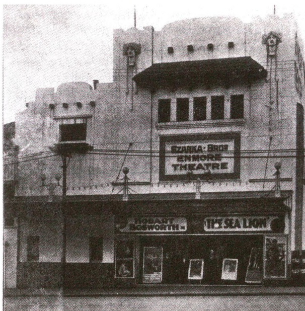
Enmore Theatre in 1912