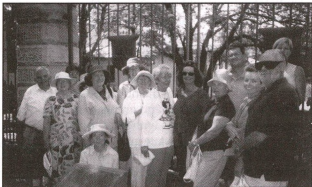
Members at original entrance gates to Annandale House now at Annandale Public School