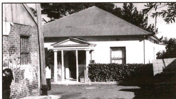
Ferndale from Kent Lane 1991