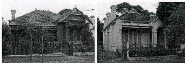
Two doomed Audley St houses