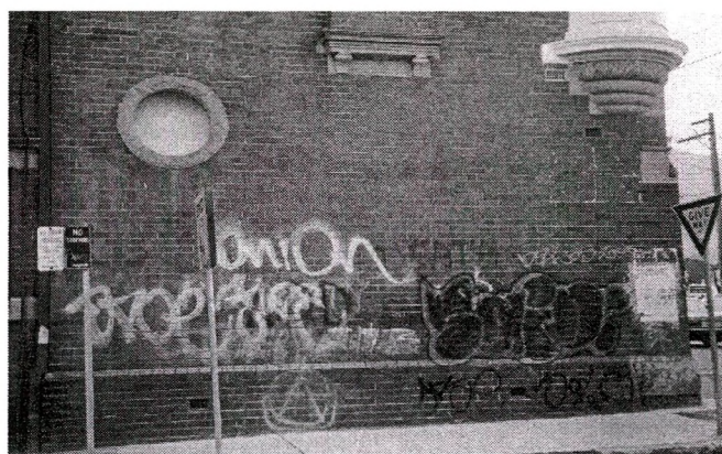
Some graffiti is positive as near some drains BOTANY BAY BEGINS IN NEWTOWN

The photo below shows the appalling state of the Dispensary Hall in Reiby Street Newtown on the corner of Enmore Road. The building owners seem impervious to the problem. (Only after council action did the owners remove illegal signage which has damaged the building fabric. Unsightly posters are a further problem.) In some councils, officers are permitted to enter property and remove graffiti at council's expense in order to deter further defacement of buildings. Marrickville Council has no apparent policy on building graffiti removal, although to its credit Council did conduct an educative anti-graffiti program with Graffiti Solutions.