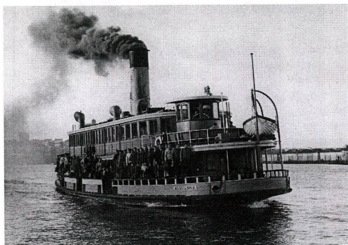
SS Kosciuszko September 1956