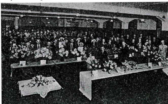
Marrickville Horticultural Society Show 19 March 1938 lower Marrickville Town Hall Australian Garden Lover August 1938 p 43