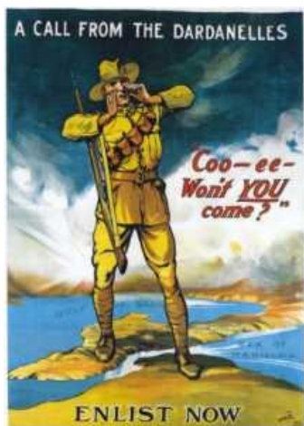
World War I enlistment poster