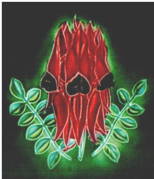
Desert peas in striking red, green and black; pre-1910 English T & R Boote & Co. tile

Towards the end of the 19th century it seems Australian artisans were brave enough, proud enough, astute enough to adapt Australiana themes for decorative purposes on all manner of day-to-day items, from doorknobs to documents. Australiana, had of course, been subject matter in its own right from the earliest days of European contact with the continent, but now it was applied to decorate tastefully, or otherwise, practical objects.