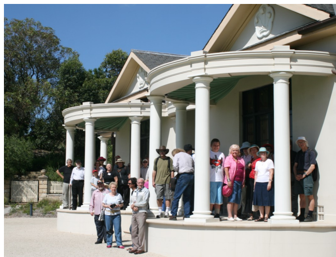
Members at Tempe House