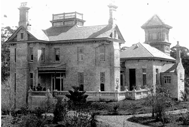
'Lauriston' built early 1880s; demolished 1959