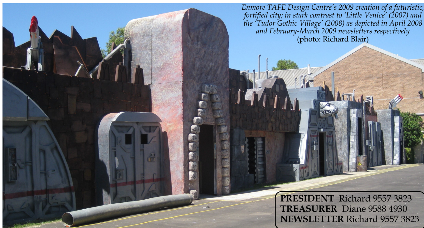
Enmore TAFE Design Centre's 2009 creation of a futuristic, fortified city; in stark contrast to 'Little Venice' (2007) and the 'Tudor Gothic Village' (2008) as depicted in April 2008 and February-March 2009 newsletters respectively