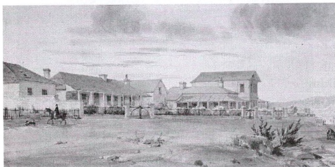
'Cumberland Street The Rocks' by Charles Rodius (1831)

With the arrival of the First Fleet in Sydney Cove in 1788 the western side of the cove became known as 'The Rocks' due to the steeply sided rocky outcrops. The area became densely populated and by the 1890s was a slum in desperate need of a clean-up. The catalyst was the outbreak of bubonic plague in 1900, resulting in the government resuming and demolishing all but one of the houses on a block of land between Cumberland and Gloucester Streets. This is now the site of the Big Dig Archaeological Education Centre and the Sydney Harbour YHA Hostel.