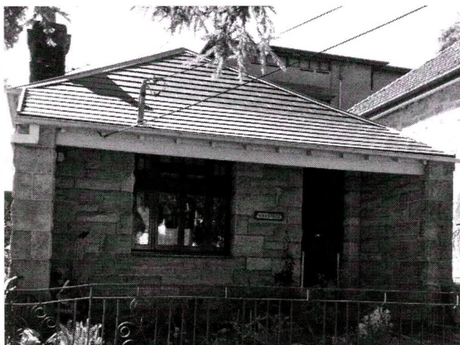
Collins Street Tempe

Also nominated were: five other fine houses including Wilga Street Dulwich Hill (Commended); the former Majestic Roller Rink/cinema at Petersham (Highly Commended); St Peters Anglican Church Cooks River (Commended); the former Marrickville police station; Marrickville Town Hall; and redevelopments for apartments of the former Enmore Public School (Highly Commended), the Stead House & Bethesda Hospital site, and a Camperdown industrial site.