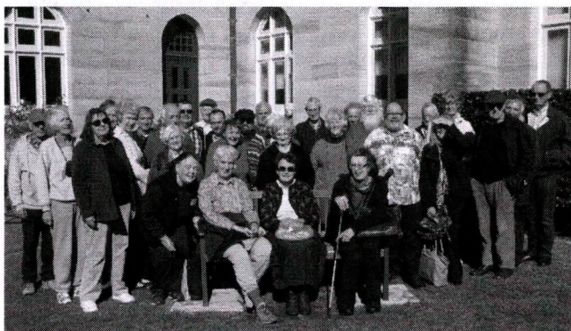
Members in grounds of Kincoppal

Note Whilst the precise whereabouts of Wentworth's Petersham house remains unclear, he is recognised locally by Wentworth Street and the house at 99 Brighton Street, which is named Wentworth .