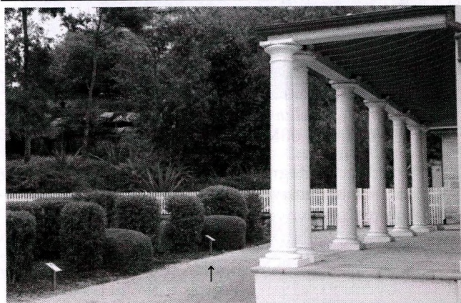
↑ marks spot of MHS-sponsored plaque: on eastern side of Tempe House, Mt Olympus behind

In addition crocus, snowdrops, tulips, tiger lilies, narcissus, daffodils, and ranunculus were ordered from English suppliers. Further awards were won for pomegranates, heath, proteas, peonies and rare cacti.