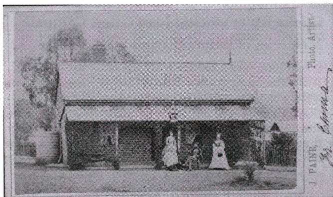
'Athelney', 96 Pile Street Marrickville in the 1890s

Marrickville Library and History Services collect, manage and provide access to a broad range of cultural heritage detailing the history of Marrickville. The Marrickville History Collection contains items relating to the social, civic and built history of Marrickville including artefacts, photographs, ephemera, ceramics, posters and oral histories. Marrickville Council Archives represents the pre-amalgamation administrative histories of Marrickville, Petersham and St Peters Councils. With archives covering rate, valuation and minute books, and correspondence it provides key insights into Marrickville's past.