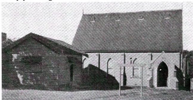
Methodist Church on corner of King St and Illawarra Rd c. 1936 (from Marrickville: 75 years of progress 1861-1936)

'This is located in Illawarra Road on the corner of King Street, just behind our house. Some years ago the side walls of the hall were sandblasted, much to the detriment of the 'sandstock' bricks. More recently these same walls were rough-rendered. The poor old hall has had a rather tough life. It was the church hall to a church which was on the northern corner of Illawarra Road and King Street. The church was demolished many years ago.'