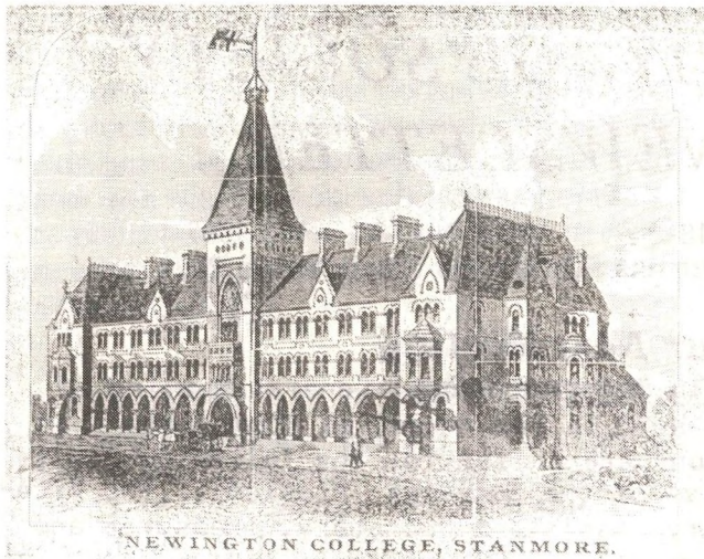
NEWINGTON COLLEGE, STANMORE.

Newington College, Stanmore (after the original design, one wing yet remaining to be completed).