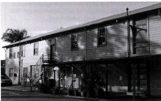
Main building at Addison Road Centre built for the Army Medical Corps in 1917

The Addison Road Community Centre is a rare open space in Marrickville with a rich environmental and social history. On the edge of the Gumbramorra Swamp it had a freshwater creek running through it, part of what may have made it attractive as a market garden in the late 19th century. In 1913 the land was resumed by the Commonwealth government for an army depot. It became a major enlistment, transit and training depot in Marrickville, and the centre for local sport and social life. In 1975 the army left and it became a multicultural community centre, one of the first in Australia.