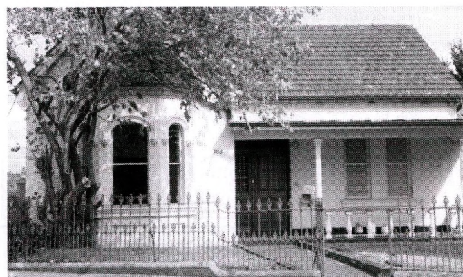
382 Illawarra Road Marrickville