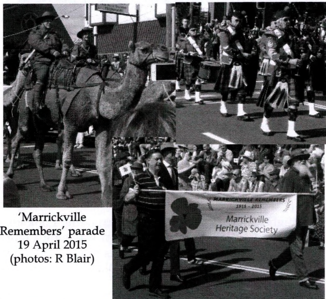
'Marrickville Remembers' parade 19 April 2015

Note $200 payment from Council to MHS was donated to Legacy