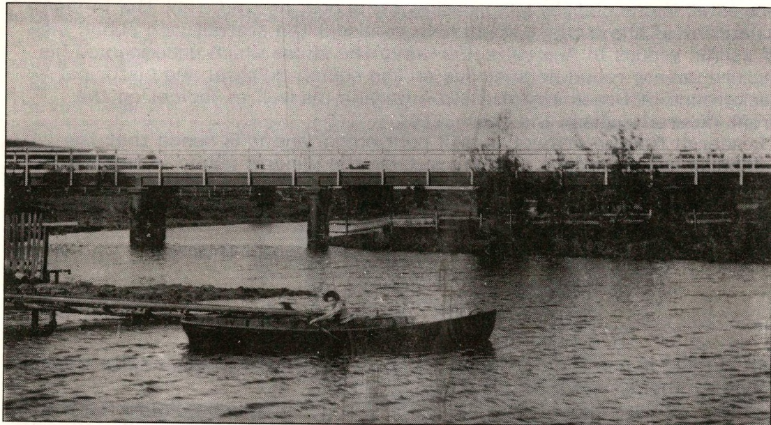
Unwins Bridge, 1912