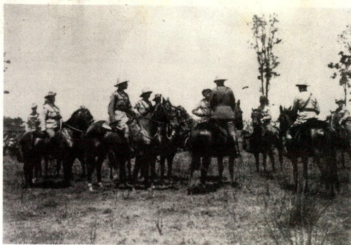
Training Australian Artillery Officers at The Warren during World War I.