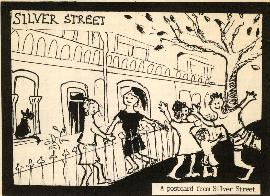
A postcard from Silver Street

Postal Address PO Box 415 Marrickville 2204 ISSN 0818-0695 Vol 6 No 11 June 1990