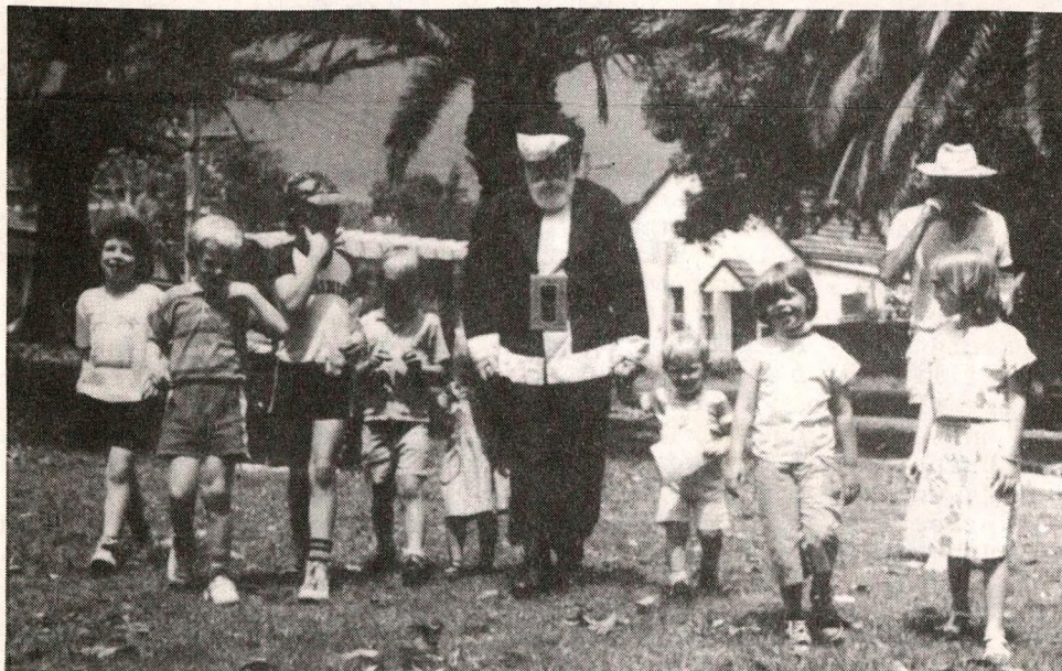
Santa and the children at our Christmas Picnic in Petersham Park.