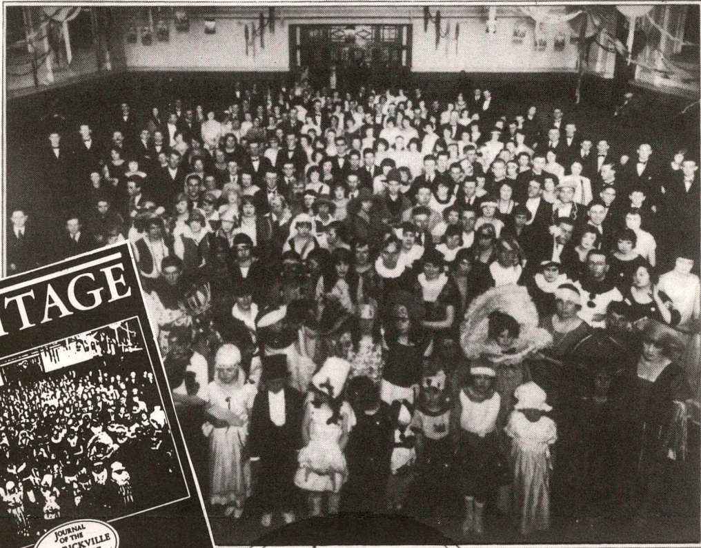
Heritage 5 cover illustration: Fancy dress party Marrickville Town Hall, 1924.

Postal Address PO Box 415 Marrickville 2204 ISSN 0818-0695 Vol 6 No 7 February 1990