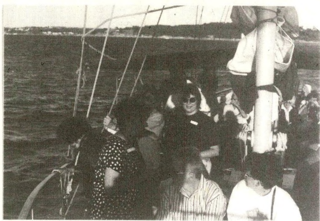
Enjoying an evening on the harbour.