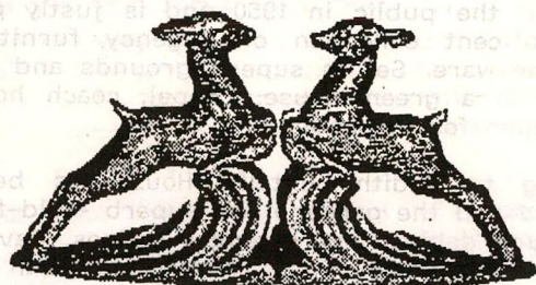
S2 25/6 Pr.

One of the specialities of the Marrickville factory were the Diana "welcome vases" which were placed on a nail in the wall near the front door and filled with flowers to welcome "the boys" when they came home from