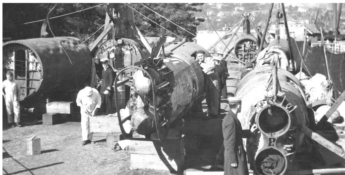
Japanese midget submarines recovered from Sydney Harbour

Every country tried to have a secret weapon that would give them an edge and help to win the war. Germany had the V1 and V2 rockets and jet planes. Britain had RADAR, the Spitfire and Winston Churchill. The USA had the ultimate secret weapon – the atomic bomb. Australia had brave and courageous men and women. Japan had submarines that could launch planes and carry midget submarines that provided both stealth and surprise. No other Navy had this capability.