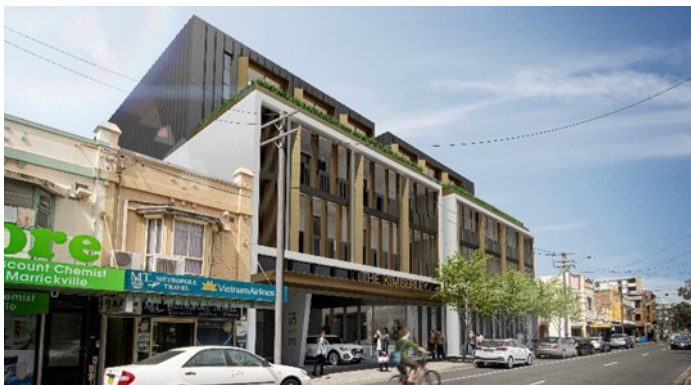
Impression of the proposed development from DA documents, Inner West Council website